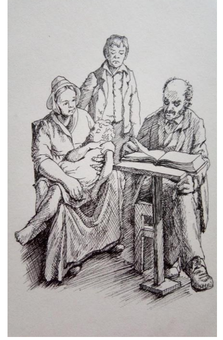
Many thanks again to Liz Young for her drawing (a copy of the Cotter's Saturday Night) which we also used in a previous edition of Encounter.